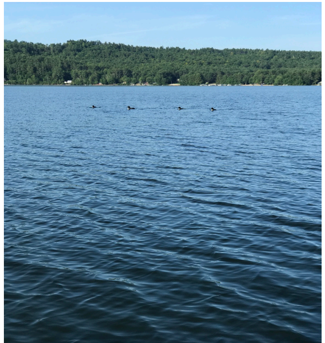
Four loons on our lake

PLA is a 501(c)3 charitable organization and as such all donations are tax deductible to the full extent allowed by law. Our EIN is 23-7337832