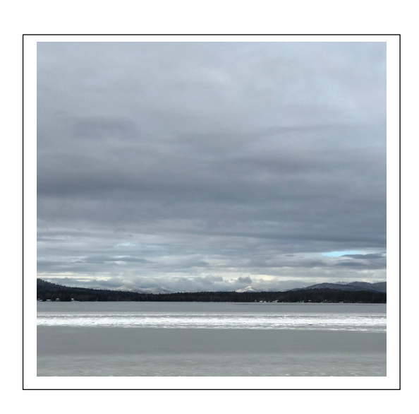
Winter on Province Lake

PLA is a 501(c)3 charitable organization and as such all donations are tax deductible to the full extent allowed by law. Our EIN is 23-7337832