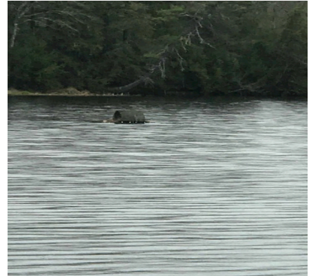
Our loons new home