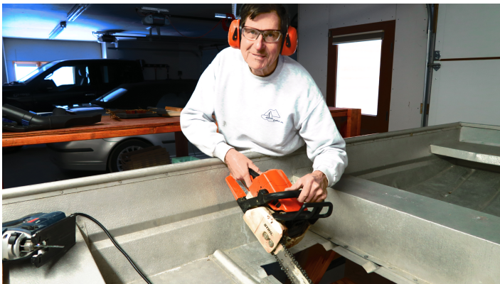
Progress on the glass bottom boat