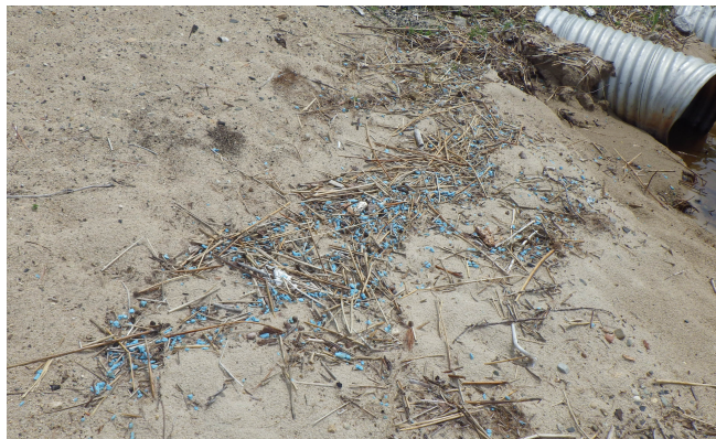
Blue polystyrene foam debris along the Rte. 153 beach

The foam physically breaks up into smaller and smaller pieces, but never really goes away. The photo shows blue polystyrene foam flakes washed up along the Maine section of beach along Rt. 153. To protect the lake, the water downstream, and ultimately the ocean, if you need flotation, it is better to something that will not fall apart, such as plastic barrels or aluminum pontoons. If you are already using polystyrene foam, inspect it each year and dispose of it properly once it inevitably starts to degrade.