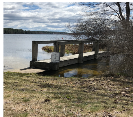
High spring lake level