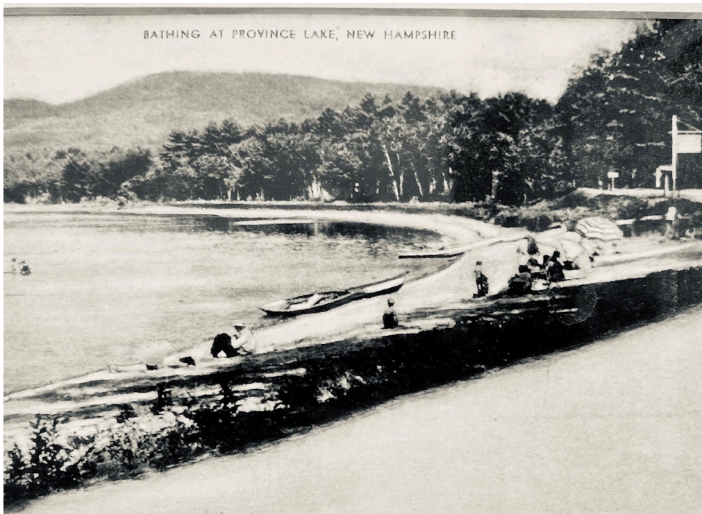
Circa 1930? Corner of Bonnyman & Rt 153, looking North